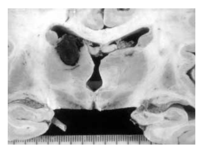
Fig. 2. — Coronal section of the cerebral hemispheres, showing a right thalamic haemorrhage involving the dorsal part of the lateral posterior, lateral dorsal and dorsal medial nuclei.

Histological examination on serial sections of the lesion were performed with Haematoxylineosin, Masson's trichrome and Phosphotungstic acid haematoxylin. The haematoma had disruptured the ependyma and bulged into the lateral ventricle. It was mainly composed of lytic red blood cells. At the border a large number of macrophages and siderophages were seen. Dilated capillaries and large reactive astrocytes were present. Arteries and venes had a normal appearance. No inflammatory, aneurysmal or fibrotic changes of the vesselwalls were observed (Fig. 3).